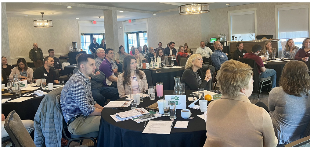
MECPA Annual Meeting attendees in May, listening, learning and networking.