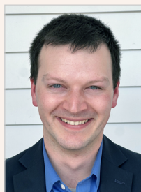
MECPA rep to AICPA Council